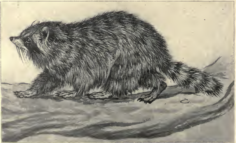
FIG. LI. PROCYON L. HERNANDEZI. HERNANDEZ'S RACCOON.